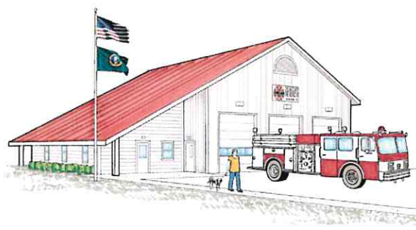
Future Fire Station North Shore